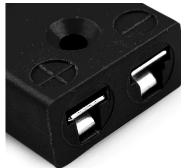
Miniature in-line Socket (dimensions in mm)

Labfacility are the UK's leading manufacturer of Temperature Sensors, Thermocouple Connectors and associated Temperature Instrumentation and stockings of Thermocouple Cables. The Company has been trading since 1971 and is ISO9001 accredited.