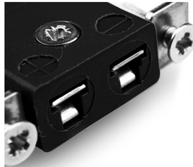
Miniature in-line Socket with stainless steel mounting bracket (dimensions in mm)

Labfacility are the UK's leading manufacturer of Temperature Sensors, Thermocouple Connectors and associated Temperature Instrumentation and stockings of Thermocouple Cables. The Company has been trading since 1971 and is ISO9001 accredited.