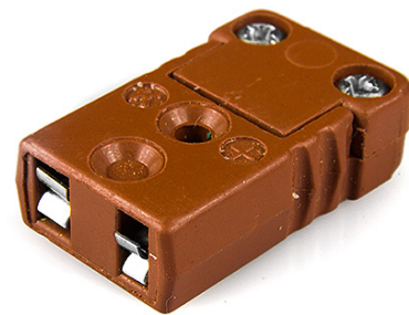
Miniature Hi-Temp Plastic in-line Socket - HTP (dimensions in mm)

Labfacility are the UK's leading manufacturer of Temperature Sensors, Thermocouple Connectors and associated Temperature Instrumentation and stockings of Thermocouple Cables. The Company has been trading since 1971 and is ISO9001 accredited.