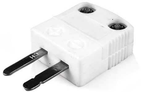
Miniature Hi-Temp Ceramic in-line Plug - HTC (dimensions in mm)

Labfacility are the UK's leading manufacturer of Temperature Sensors, Thermocouple Connectors and associated Temperature Instrumentation and stockings of Thermocouple Cables. The Company has been trading since 1971 and is ISO9001 accredited.