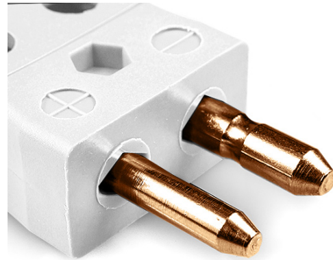
Standard in-line Plug - Quick Wire (dimensions in mm)

Labfacility are the UK's leading manufacturer of Temperature Sensors, Thermocouple Connectors and associated Temperature Instrumentation and stockings of Thermocouple Cables. The Company has been trading since 1971 and is ISO9001 accredited.