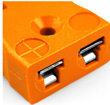
Miniature in-line Socket - Quick Wire (dimensions in mm)

Labfacility are the UK's leading manufacturer of Temperature Sensors, Thermocouple Connectors and associated Temperature Instrumentation and stockings of Thermocouple Cables. The Company has been trading since 1971 and is ISO9001 accredited.