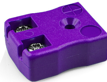
Miniature in-line Socket - Quick Wire (dimensions in mm)

Labfacility are the UK's leading manufacturer of Temperature Sensors, Thermocouple Connectors and associated Temperature Instrumentation and stockings of Thermocouple Cables. The Company has been trading since 1971 and is ISO9001 accredited.