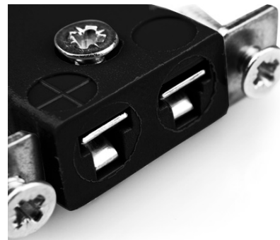
Miniature Socket -

Quick Wire with stainless steel mounting bracket