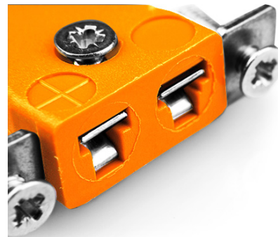
Miniature Socket - Quick Wire with stainless steel mounting bracket (dimensions in mm)

Labfacility are the UK's leading manufacturer of Temperature Sensors, Thermocouple Connectors and associated Temperature Instrumentation and stockings of Thermocouple Cables. The Company has been trading since 1971 and is ISO9001 accredited.