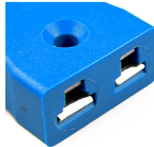
Miniature PCB Socket (dimensions in mm)

Labfacility are the UK's leading manufacturer of Temperature Sensors, Thermocouple Connectors and associated Temperature Instrumentation and stockings of Thermocouple Cables. The Company has been trading since 1971 and is ISO9001 accredited.